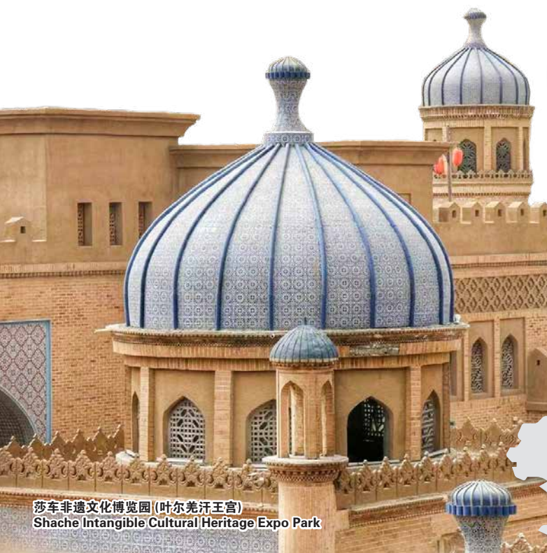
莎车非遗文化博览园(叶尔羌汗王宫) Shache Intangible Cultural Heritage Expo Park

※ Sequence of the itinerary is subject to change according to the final flight confirmation.