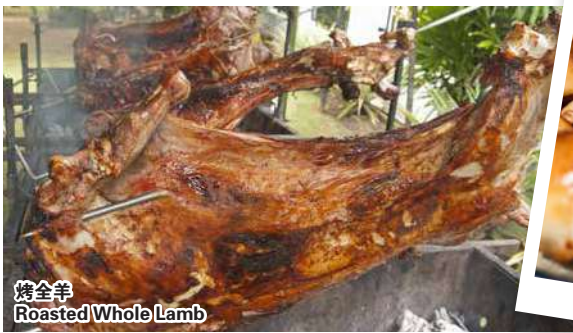
烤全羊 Roasted Whole Lamb