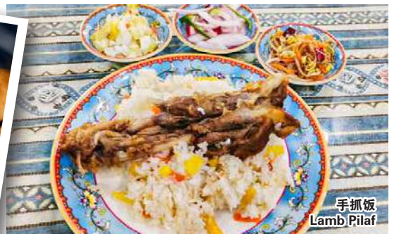
手抓饭 Lamb Pilaf