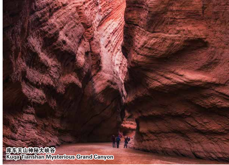
库车天山神秘大峡谷 Kuqa Tianshan Mysterious Grand Canyon

这座城市独特地融合了伊斯兰和中亚的影响，这在其建筑、美食和生活方式中显而易见。老城区拥有迷宫般的街道和传统房屋，反映了数百年的历史和文化。