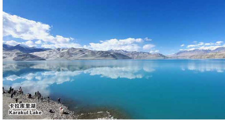
卡拉库里湖 Karakul Lake

The strong exotic style, the blue dome paired with the earth-colored walls, as if traveling to the neighboring 'Stan country'. The shooting position is too rich, all angles are very photogenic.