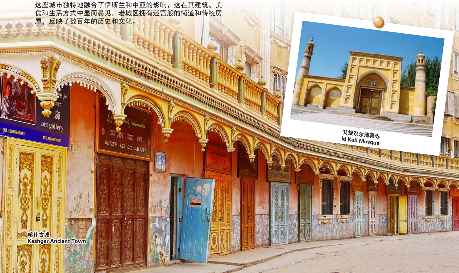
艾提尔清真寺 Id Kah Mosque