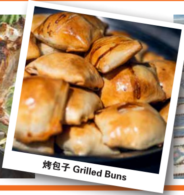
烤包子 Grilled Buns